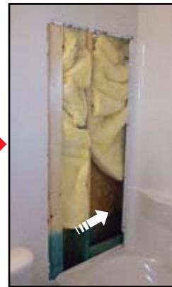
PROBLEM: pinpointed in exterior wall