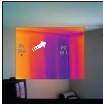
New home. Insulation missing in purple location.