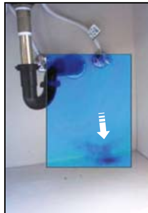
Mold under bathroom sink.