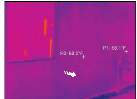
AFTER: Insulation repaired in exterior wall