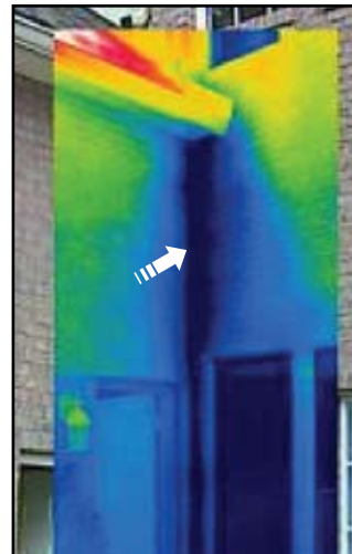
Moisture penetration in wall