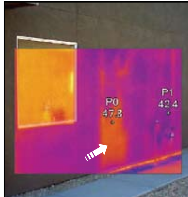
BEFORE: Possible missing insulation exterior wall